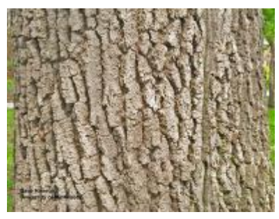
Photo: Dave Hanson, UMN./FR Figure 15: Mature bark of red oak (Q. rubra)

Large wood rays are clearly visible to the naked eye. Within an annual growth ring, springwood has distinctly larger pores versus