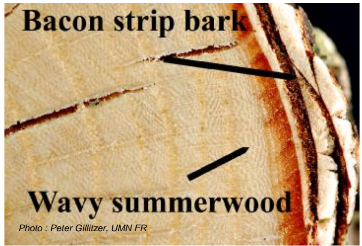
Figure 6: Summerwood is wavy. Bark resembles bacon strips.

End grain-ring porous: Summerwood: small pores arranged in a wavy "tire track" pattern (Figure 6). Sapwood: white to tan colored. Heartwood: brown to reddish brown.