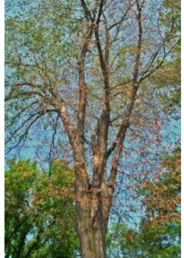
Figure 2: Elm tree infected with Dutch Elm Disease

A relatively new devastating pest has been killing both urban and rural trees - the emerald ash borer (EAB) (Figure 3). All species of ash in the Fraxinus genus (green, black, white...) are susceptible to this aggressive insect and once again, monitoring the movement and storage of firewood is critical to a