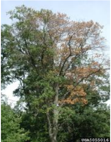
Figure 1: Oak tree infected with oak wilt