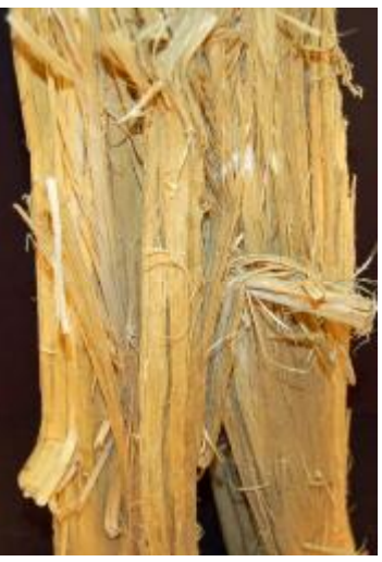
Figure 8: Stringy firewood characteristic of some elm species