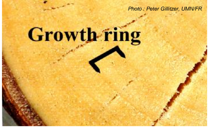
Figure 5: Group examples- maple (including boxelder), birch, some poplars, basswood (a.k.a. linden), ironwood, buckeye, and black cherry

Diffuse Porous. Within an annual growth ring, springwood and summerwood are not distinctly different. Wood within an annual ring looks uniform.