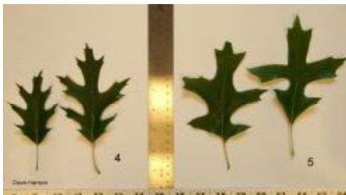
Figure 10: Species of red oaks have pointed leaf margins.