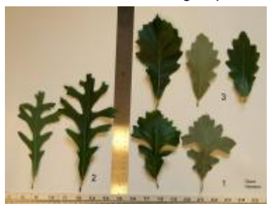
Figure 11: Species of white oaks have rounded leaf margins.

Applying a 10% solution of sodium nitrite to the heartwood makes the natural light brown color of the red oak group heartwood only slightly darker (Figure 13). However, it turns the white oak group heartwood yellow-orange, then red-brown, and then dark green or purple to black (Figure 14).