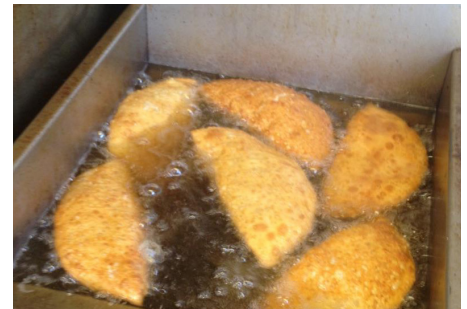
Frying fleischkuekle in the M & L Concessions chuck wagon.

HACCP is a science-based approach to manufacturing food products. The goal behind the HACCP program is to identify the crucial steps in the manufacturing process and to gain complete control over those places