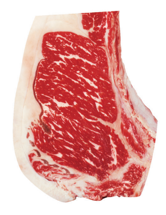
Beef marbling: moderately abundant

Grading is provided through a fee-based service by the USDA-AMS. Once a plant is approved for AMS grading services, then the USDA will schedule Todd to visit the plant to grade the carcasses. Payment for services will be paid directly to the USDA-AMS. The application for grading services is available at <a href="https://www.ams.usda.gov/resources/lps109">https://www.ams.usda.gov/resources/lps109</a>.