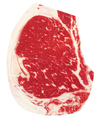
Beef marbling: slightly abundant

can fetch higher premiums. AMS graders can also provide yield grades, which can be used to evaluate beef carcass finishing characteristics. Some beef producers may augment their feeding and finishing practices based on yield grading. The grading is done on chilled carcasses, after separating the 12th and 13th rib, so the grading services can be scheduled at the convenience of the plant and the grader. More information on carcass grades is available at <a href="https://www.ams.usda.gov/grades-standards/carcass-beef-grades-and-standards">https://www.ams.usda.gov/grades-standards/carcass-beef-grades-and-standards</a>.