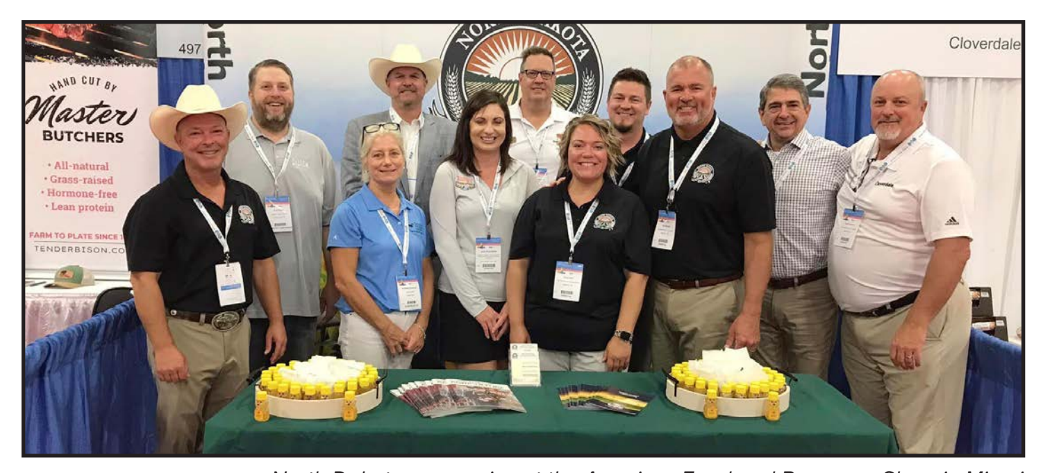
North Dakota companies at the Americas Food and Beverage Show in Miami

Marketing & Utilization Grants provide necessary assistance to the research and marketing needs of the state by developing new uses for agricultural products and by-products, and by seeking efficient systems for processing and marketing these products. These grants are also used to promote efforts that increase productivity, provide added value to agricultural products, stimulate and foster agricultural diversification and encourage processing innovations.