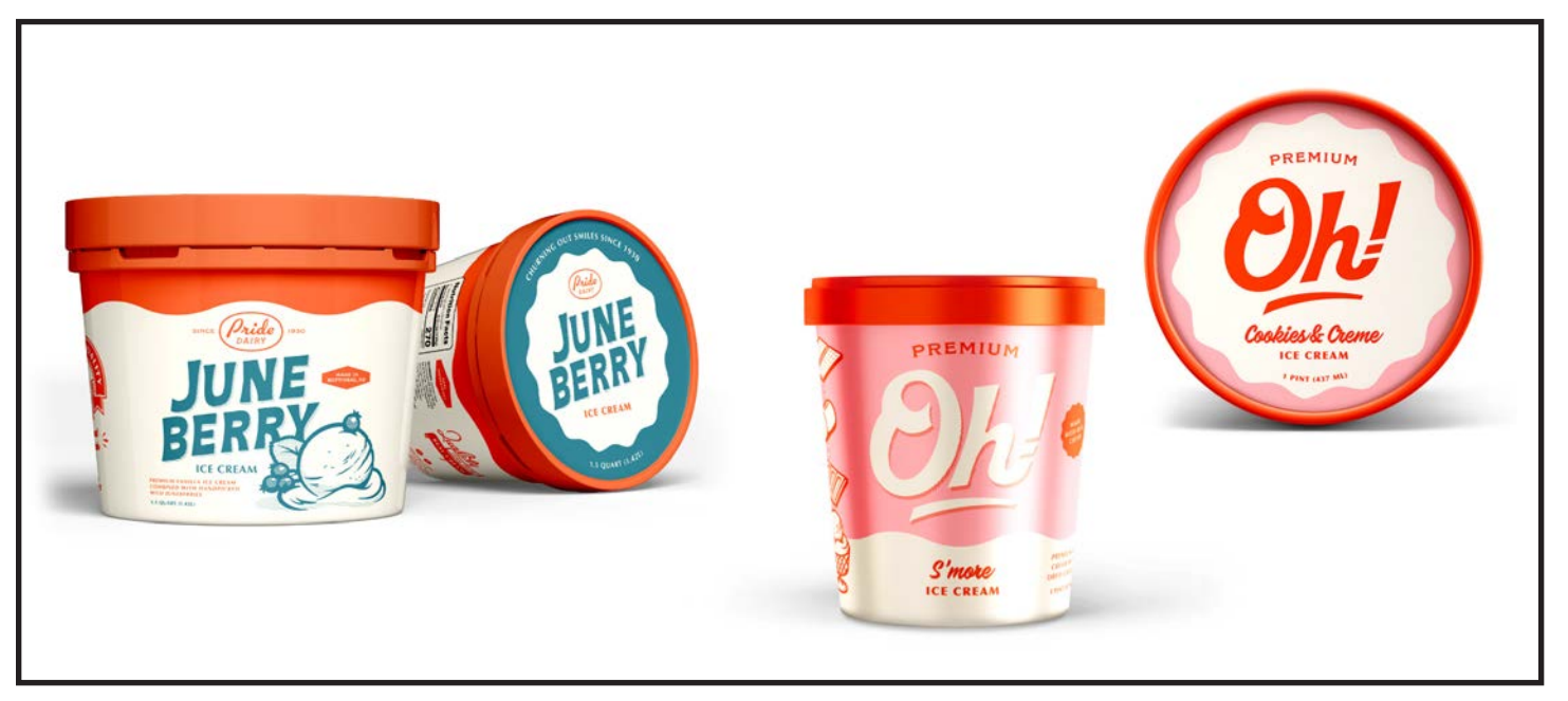
L to R: The refreshed branding for the signature Pride Dairy brand and the Oh! premium branding

Pride Dairy has been around since the 1930s and is the last small town creamery in the state of North Dakota. They have grown from making milk and butter to manufacturing and selling numerous products, including ice cream shakes, malts, caramels, syrups, toppings and signature dishes.