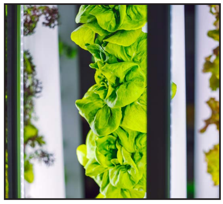
Hydroponic vertical farm

Phase one has already begun and involves INVISIONit LLC developing a mechanical device to house a smart phone friendly video camera to be used in conjunction with an automated tarp system. This device will make it much easier and safer to monitor the loading and unloading of grain trailers, seed tenders or any bulk container equipped vehicle from the drivers seat or cab that have a motorized tarp covering/retracting system on it without having to leave the safe confines of the drivers seat or cab of the vehicle. There are two prototypes being manufactured