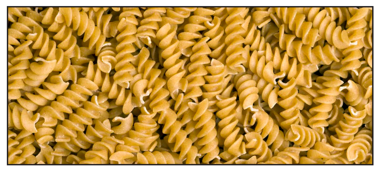
Whole wheat rotini

Farm Diversification Grants give priority to projects dealing with the diversification of a family farm to non-traditional crops, livestock, or on-farm, value-added processing of agricultural commodities. Traditional crops and livestock are generally defined as those that the North Dakota Agricultural Statistics Service maintains statistics on. The project must have the potential to create additional income for the farm unit.