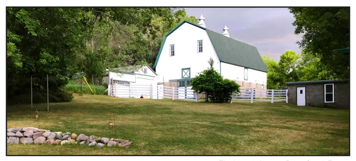
The historic barn at Burnt Creek Events

Nature-Based AgriTourism Grants are for enterprises which seek to attract visitors to a working farm or ranch, or any agricultural, horticultural or agribusiness operation to enjoy, be educated or be involved in activities. Eligible projects include but are not limited to farm or ranch tours, hands-on chores, self-harvesting of produce, hunting operations, fishing operations located on applicants' land, bird watching, trail rides and corn mazes.