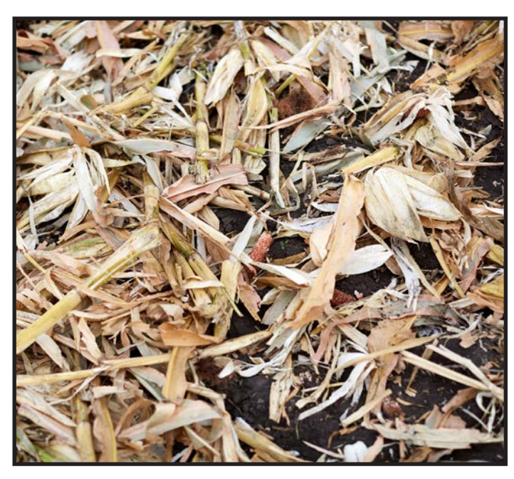
Corn stalks and chaff (biomass)

with more expensive GMO corn and their traits. Bass Genetics will be combining these natural characteristics with tillage and other agronomic techniques, proven in numerous plot trials, to cover most any condition a farmer may have. This will give the farmer confidence and information to be more effective and economical in producing non-GMO corn on their farm. Non-GMO hybrids will open additional markets to the farmers as non-GMO demands grow worldwide.