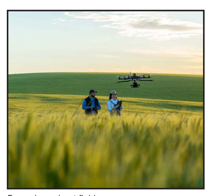
Drone in a wheat field

and "real world" trials will be performed for 30 days to prove the utility of the device while patents are being filed. Phase two will begin when the patent process has been completed and patents have been obtained. INVISIONit will begin the manufacture, marketing and commercialization of the product. A website is already being built but will not be published until a patent is approved. Internet search engines and social media influencers will also be utilized to increase market presence. A sales force will need to be hired as well for point of contact sales and customer service. INVISIONit LLC will then pursue additional grant monies for the marketing and commercialization of the patented product.