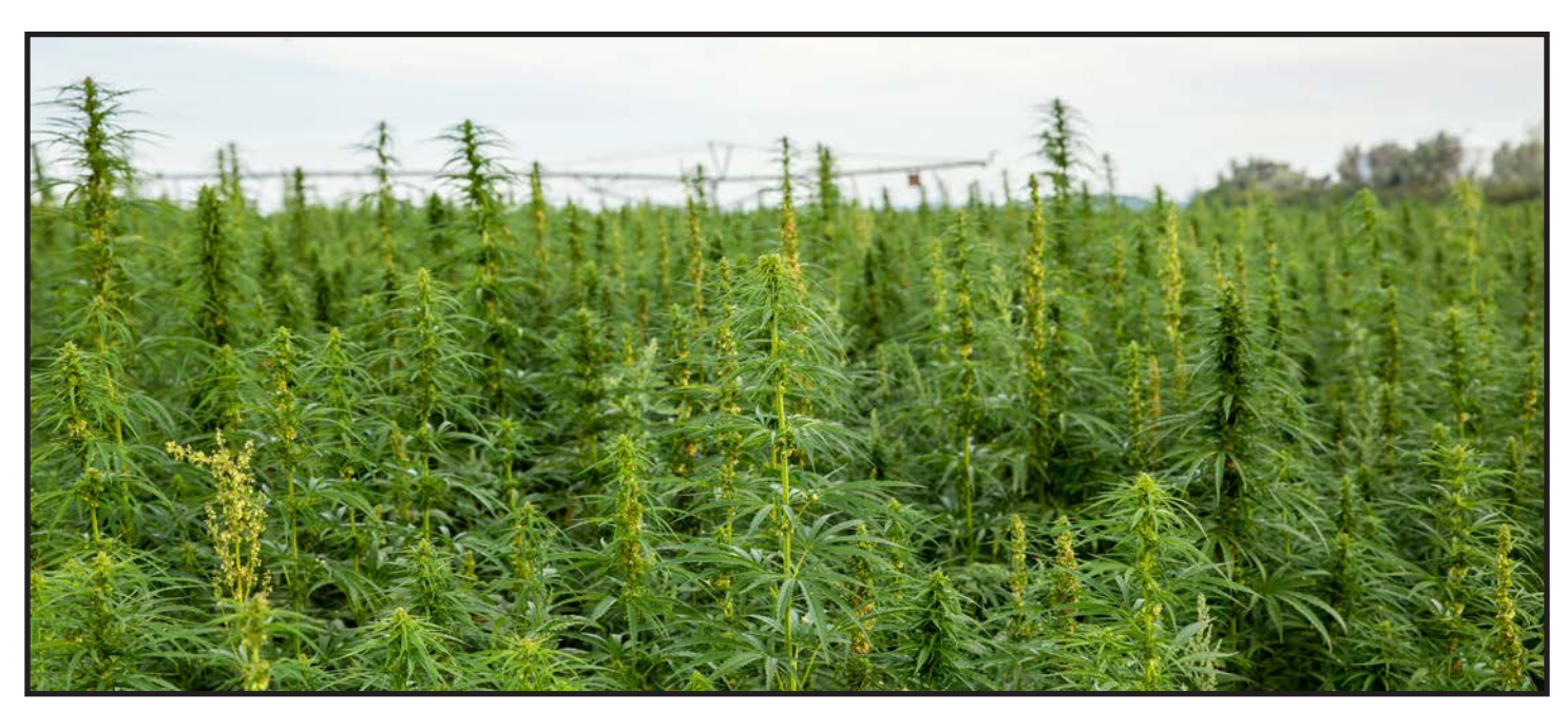
A field of North Dakota hemp

APUC provides grants in two areas of agricultural innovations: Prototype Development & Technology Grants. A huge array of equipment can be useful in conducting business in rural living and agricultural economics. Prototype Grants are restricted to inventions improving the operations of food processing equipment and agricultural equipment. Technology Grants are to encourage innovation and APUC maintains a broad view of technology, such as hardware, software, devices or processes. Biotechnology will be considered as long as those advances improve agricultural product utilization such as food, feeds, fuels and fiber.