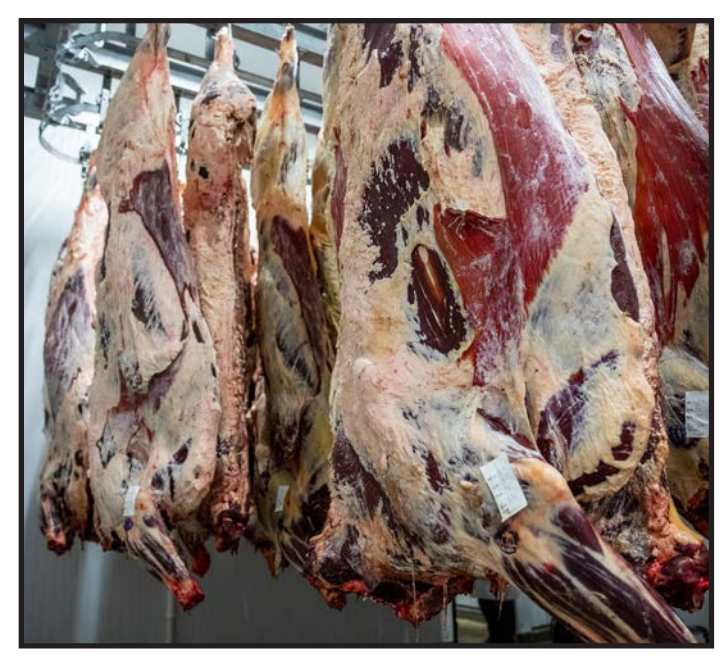
Beef waiting to be further processed at South 40 Beef

Funds will be used to contract with Dakota Global Consulting, LLC, a North Dakota consulting firm that specializes in livestock and food production, to conduct the study. Dakota Global Consulting will subcontract Process Systems Co., LLC (Omaha, NE) to develop a facility plan that includes layout and equipment.