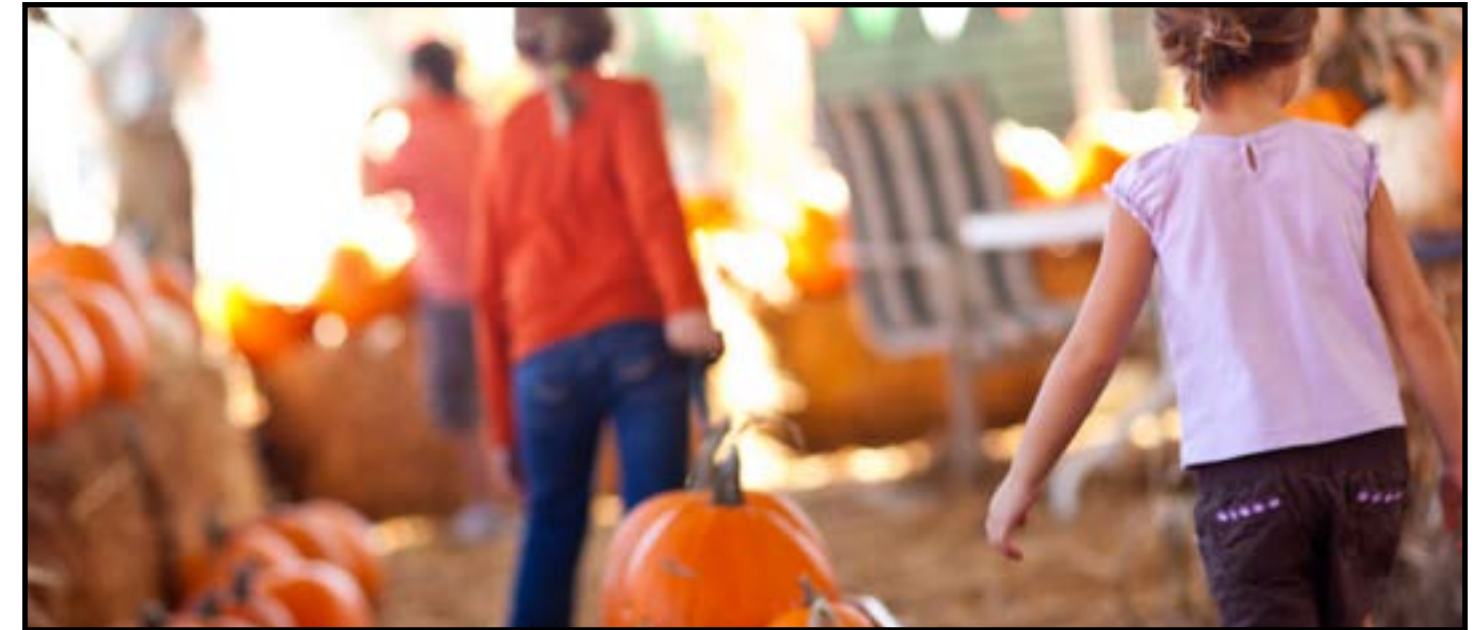
Kids at a pumpkin patch

Consumer demand is on the rise for more health-targeted foods and food sources. Dakota Don's Artisan Waffles strives to enter new markets with the development of gluten-free and high-protein waffle mixes. Ingredients will continue to be locally sourced when possible, and marketing efforts will include focus of North Dakota products.