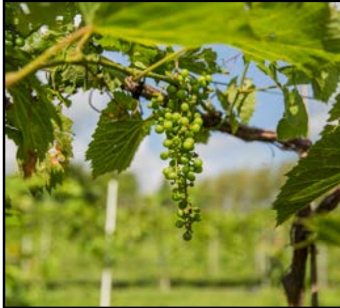
North Dakota grapevines

to tomato and pea plants that will add to the ability of the pro-biotic plant growth beneficial bacteria Azospirillum brasilense to increase resistance towards one bacterial and one fungal phytopathogen. Commercialization efforts are ongoing discussions within a growing network of communicators, collaborators, farmers, and stakeholders.