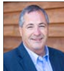
DOUG GOEHRING Agriculture Commissioner