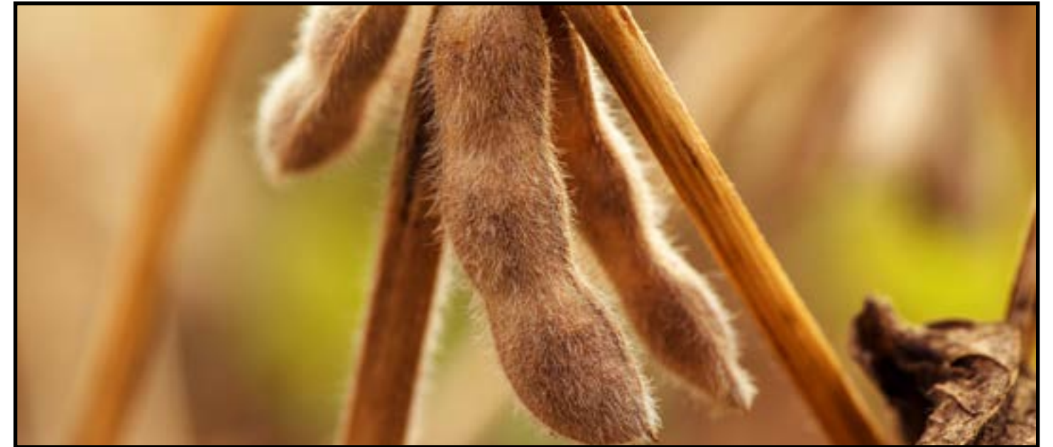
Ripe soybean pods

A new custom-exempt meat processing facility and retail space will be established for the local community and tourists visiting the Pembina Gorge State Recreation Area. Custom smoking services and deer processing will be key aspects of the business alongside beef and pork processing offered for local consumers, farmers, and hunters.