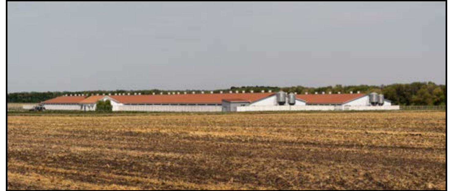
Modern swine facility

The goal of the proposed research is to develop health targeted high value crops for North Dakota by evaluating the nutritional and anticancer properties of compounds from the extracts of oregano and related high phenolic crops, targeting effectiveness in treating prostate and breast cancer at the bone sites, which are the terminal stage for these cancers. Currently, there are no anticancer drugs to treat the prostate and breast cancer bone metastasis. The proposed studies expand a prior APUC funded project that showed the anticancer capabilities of oregano and cranberry extracts using the unique testbed for metastasis that is developed at NDSU and helped identify specific phenolic compounds in the extracts that are likely to inhibit cancer.