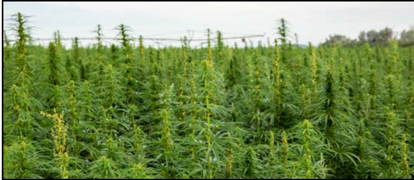
A field of North Dakota hemp

APUC provides grants in two areas of agricultural innovations: Prototype Development & Technology Grants. A huge array of equipment can be useful in conducting business in rural living and agricultural economics. Prototype Grants are restricted to inventions improving the operations of food processing equipment and agricultural equipment. Technology Grants are to encourage innovation and APUC maintains a broad view of technology, such as hardware, software, devices or processes. Biotechnology will be considered as long as those advances improve agricultural product utilization such as food, feeds, fuels and fiber.