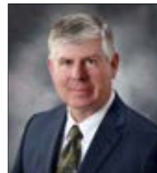
WADE BOESHANS Governor's Appointee