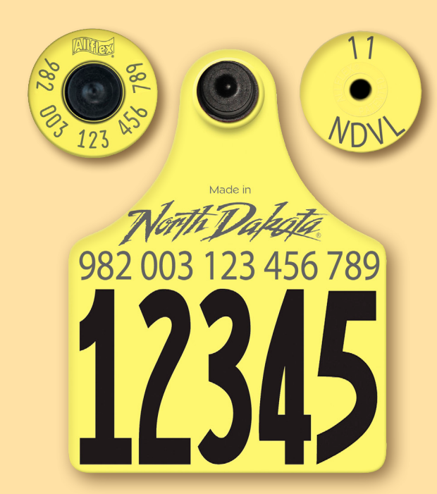
Proposed ear tags for the North Dakota Verified Livestock program.

Age & Source Verification begins with the cow/calf producer. Participating producers are required to have verifiable birth records and individually identify cattle with a program compliant tag prior to leaving the ranch of origin.