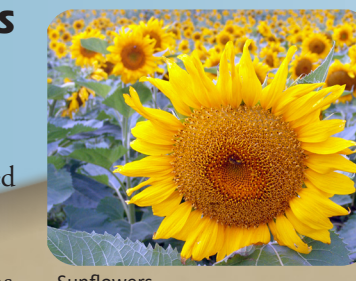
Sunflowers taken to Russia where modern commercial varieties

North Dakota traditionally leads the nation in