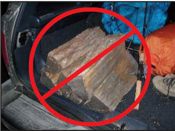
Emerald ash borer is spread to new areas by infested firewood.