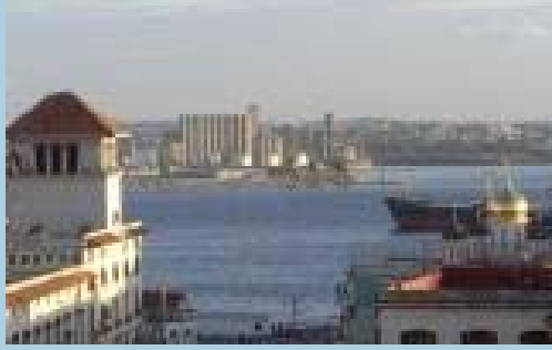
Havana Port—November 2010

New guidelines for license applications for Cuba travel-related transactions are now available at: