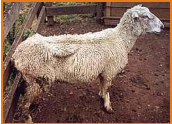
A sheep showing symptoms of Johne's disease.

Since the signs of Johne's disease are similar to those for several other diseases—parasitism, dental disease and caseous lymphadenitis (CLA), laboratory tests are needed to confirm a diagnosis.